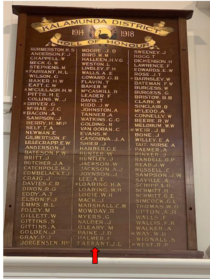
Kalamunda District Roll of Honour