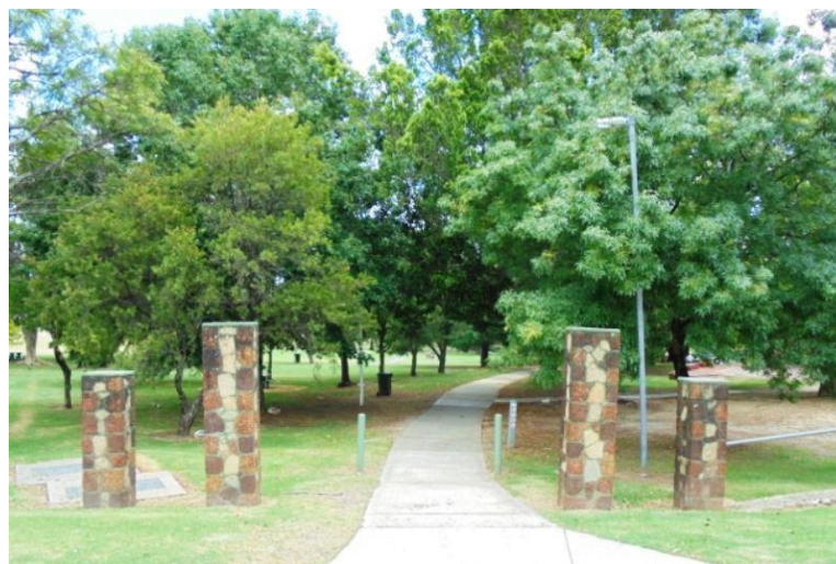
Stirk Park Memorial Walk